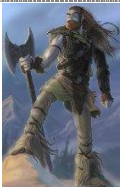
ELRIC SVENT Barbarian